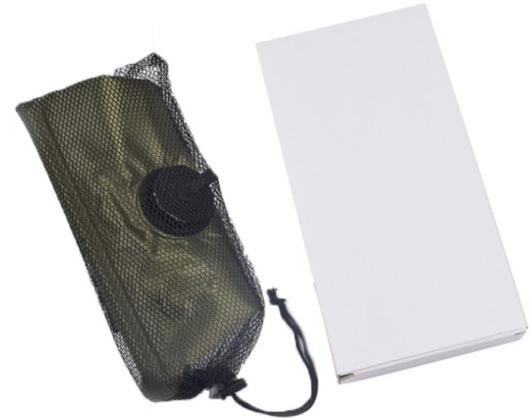
Regular Mesh Carry Bag