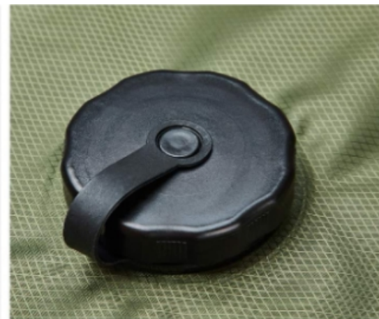
2. Upgrade Large Filling Valve