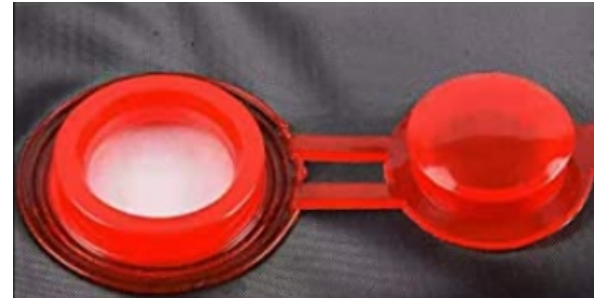
DURABLE & SAFE

Prevent the handle from broken when full filled.