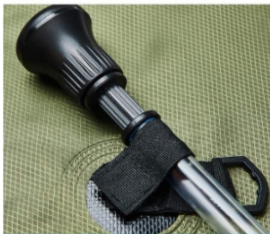
3. Convenient Velcro Straps