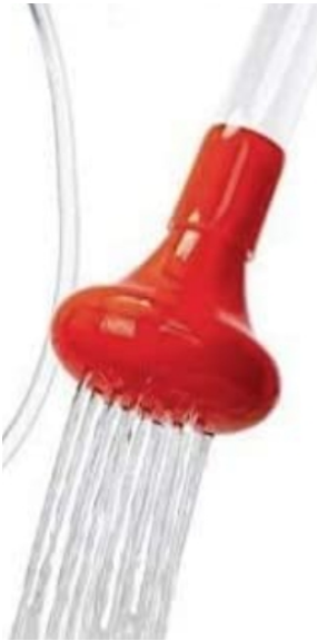
Regular Sized Sprayer