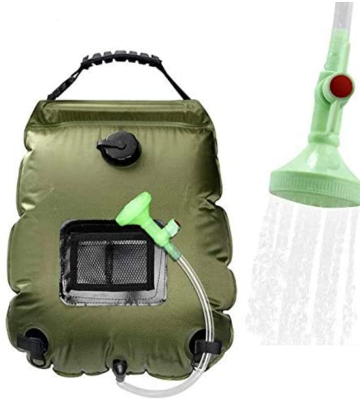
Large Sized Sprayer