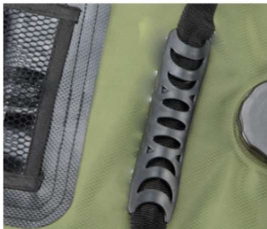
1. Strengthened Handle