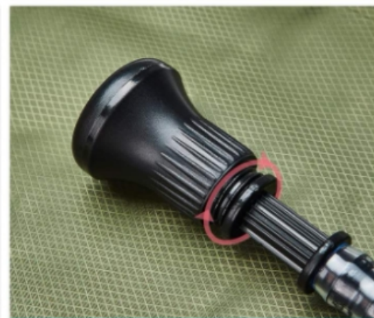
4. Upgrade On-off Shower Head-No Leak anymore