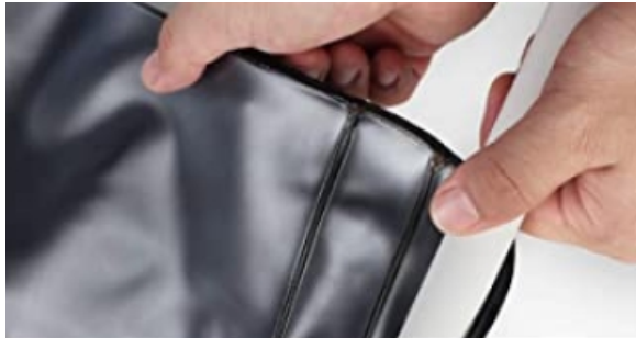
HEAVY LOADING SUPPORT

It's convenient to hang the shower bag on the tree or shower tent using included hook rope.