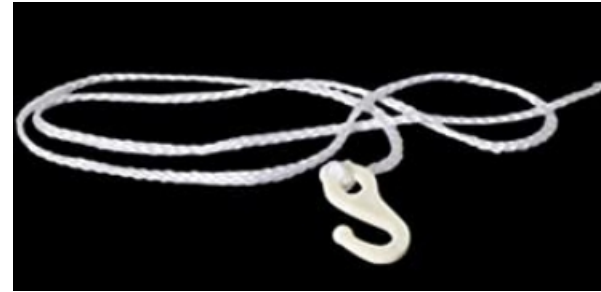
Convenient with Hook Rope

Large filling valve with cap for easy filling water.