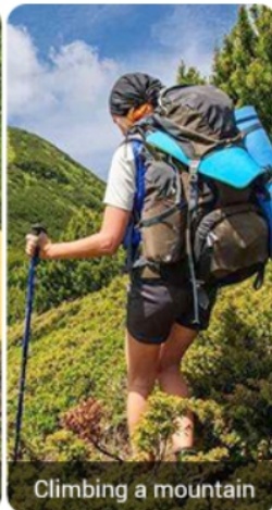
Climbing a mountain